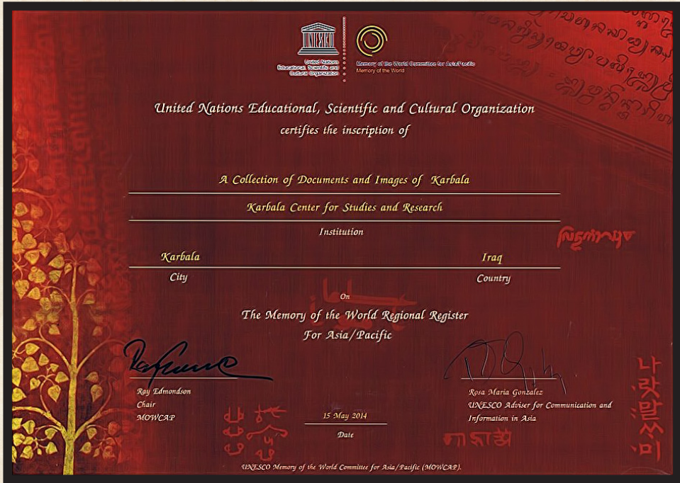
International accreditation certificate for the Karbala Center for Studies and Research from UNESCO (Global Memory Program) Approval date: 102014/28/ AD