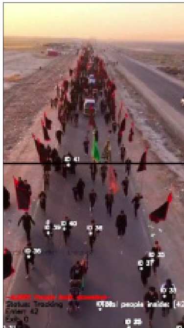
Figure 4: People counting using a drone-mounted camera

Fig.4 shows A frame taken from a drone video, which shows a large crowd of people. The system detected 42 people in a single frame; the provided result reflects the model’s ability to handle large-scale scenes. The top-down perspective enabled the system to capture many individuals at once, without the need for multi-frame temporal analysis. Although there were some difficulties in detection in areas where crowds appeared closely spaced or overlapping, especially when objects were small due to distance, the system provided relatively accurate results that reflected the actual size of the crowd. This case demonstrates that the model maintains its effectiveness even under aerial conditions, making it suitable for applications such as aerial crowd monitoring and analyzing crowd density at public events or open spaces, without the need for complex tracking tools or additional equipment.