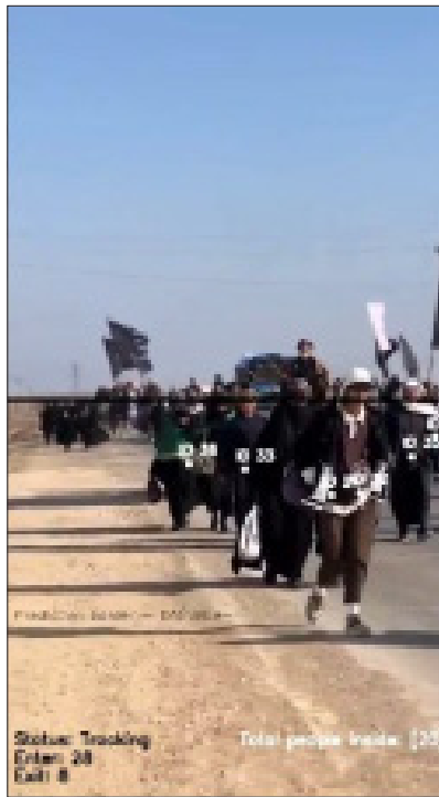
Figure 3: People counting using a fixed camera

The system was able to detect 20 people within the frame, with overall performance considered good given the nature of the scene. The model demonstrated an effective ability to handle the horizontal angle without significantly impacting detection accuracy. It maintained a high level of counting accuracy, despite some overlap between individuals in the foreground. Homogeneous and consistent lighting helped improve the model's performance and reduced the potential for errors caused by shadows or high contrast. The weaknesses of the model included the difficulty distinguishing people overlapping in the far-away background, as the objects appeared too close together, causing some clusters to be counted as a single entity. This resulted in a slight decrease in overall counting accuracy, a known challenge in high-density scenes or those shot from narrow depth angles.