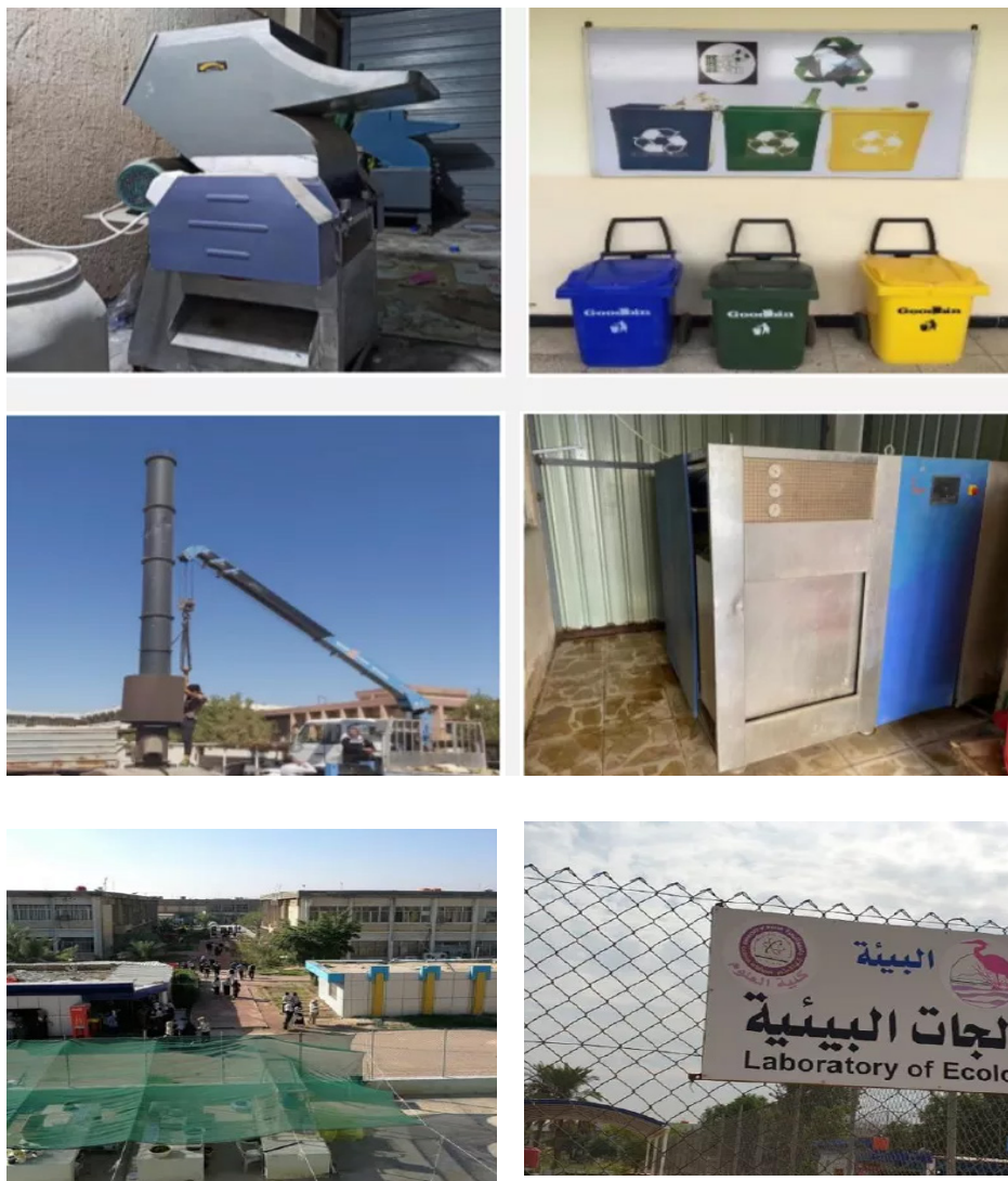
Figure 2: University of Basrah Waste Recycling Initiative