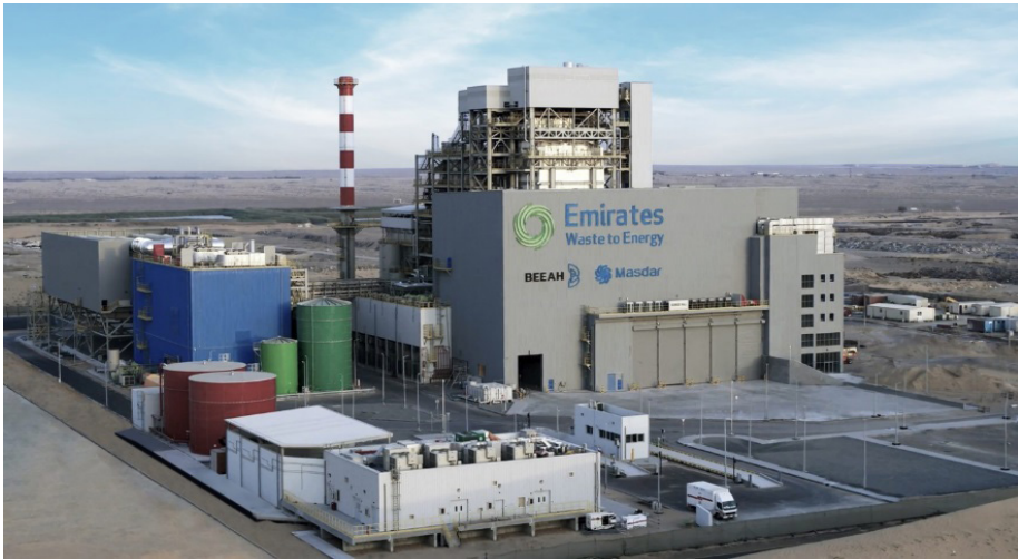
Figure 3: Sharjah Waste-to-Energy Plant

A good example of waste recycling and energy production plants in the Middle East is the Sharjah Solid Waste Recycling and Power Plant in the United Arab Emirates (12), as the main objective of this plant is to reduce greenhouse gas emissions, achieve carbon neutrality and reduce the effects of climate change to preserve the environment. The plant treats 300,000 tons of solid waste per year, generating 30 megawatts of energy per year, enough to power 28,000 homes. This, in turn, contributes to the displacement of 450,000 tons of harmful carbon dioxide emissions (13), which leads to raising and improving the sustainable quality of life in the Emirate of Sharjah figure 3.